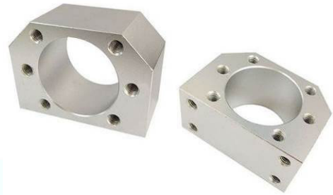
Fig.: 16H, 20H